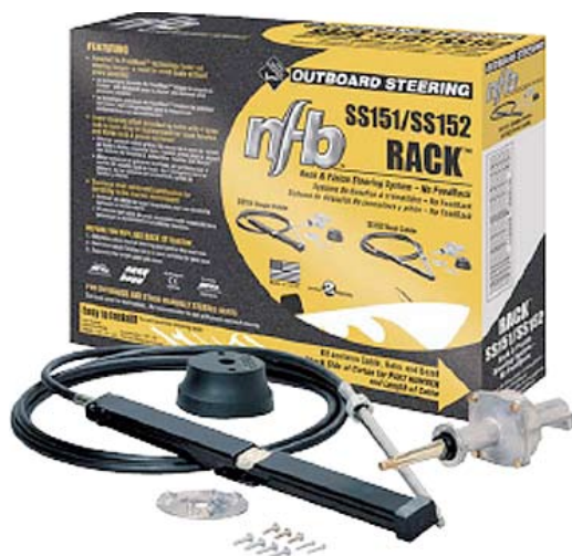
NFB™ RACK SINGLE CABLE SYSTEM (Steering Wheel not included.)