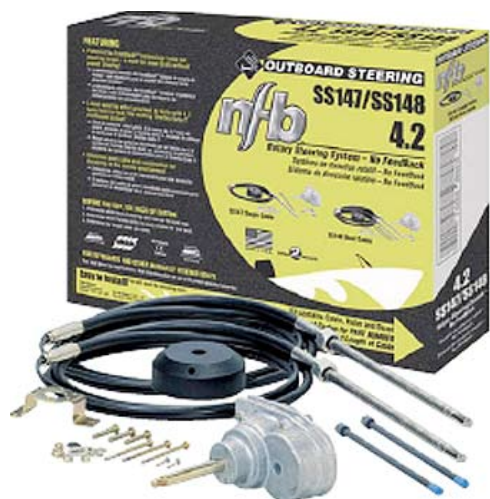
NFB™ 4.2 DUAL CABLE SYSTEM (Steering Wheel not included.)

SS148 Kits are sold in lengths from 12 – 16 feet. All other lengths will require the purchase of individual components.